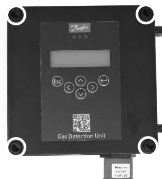
Figure 6: Closed Premium device with new cover and display PCB