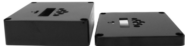
Figure 1: Different cover heights