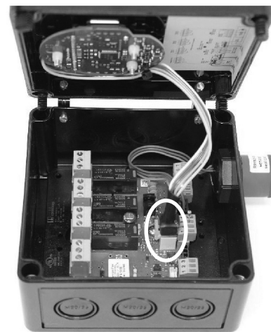
Figure 5: Plug-in the display connector