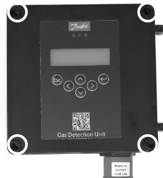
Figure 1: Closed Premium Device