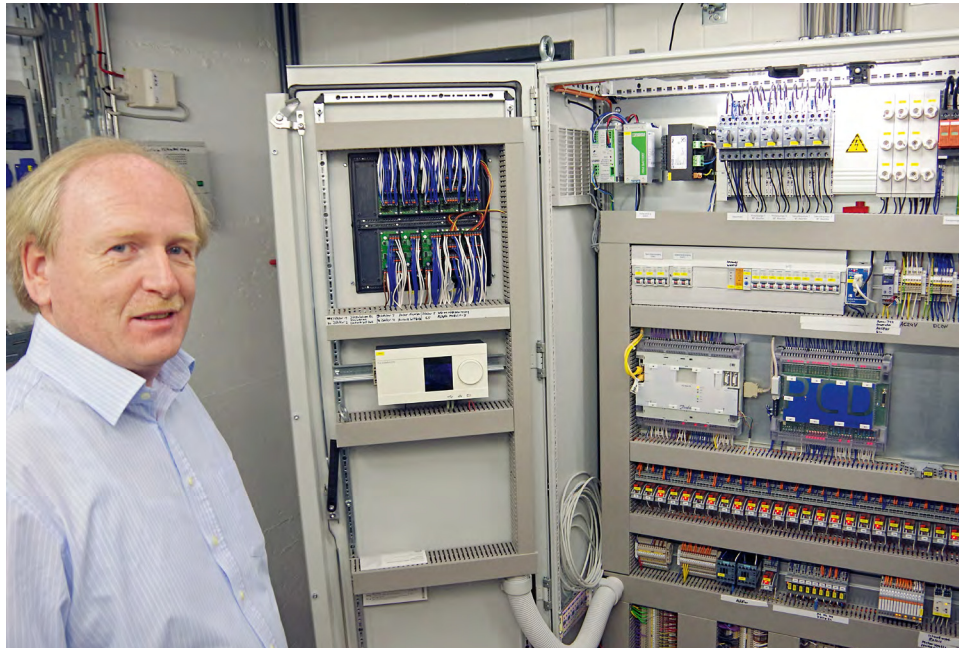
Danfoss' ECL Comfort controllers in the district heating system are connected to the internet and thus make its data available to the web-based SCADA software Leanheat® Monitor.

Efficiency is at the top of the agenda at Stadtwerke Altensteig, and Leanheat® Monitor supports this objective. "A district heating network is operating at a high level of efficiency when the return temperatures are as low as possible," explains Gerd Schreiber. Limit values of the return temperatures are monitored by the controllers. If they were exceeded, a combined heat and power plant would have to be disconnected from the grid, for example. Leanheat® Monitor monitors the return temperature and identifies consumers that exceed the limits. Intervention by the network operator can therefore be carried out quickly and with little research effort at the right place – with the result that the stability of the district heating network always remains high. Stadtwerke Altensteig's experiences with Leanheat® Monitor are promising: "Our already high expectations of the new software were met in every respect, in some cases even exceeded. Working with Leanheat® Monitor is easy, fast and clear," says Lothar Weber with satisfaction.