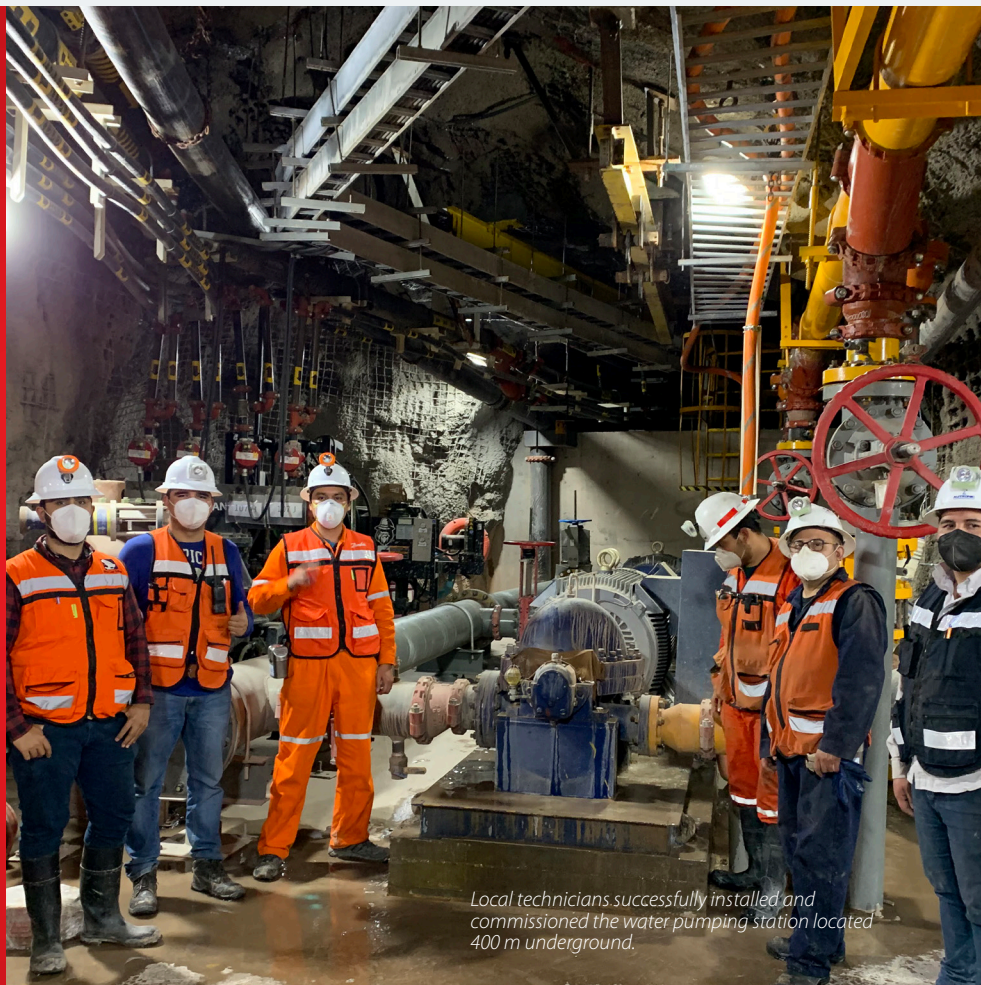
Local technicians successfully installed and commissioned the water pumping station located 400 m underground.

Installing an effective water pumping system became a multi-phase project. Firstly, the diagnosis was made following on-site visits, then evaluation and selection of solutions commenced. Finally, the solution was installed and commissioned. In each of the phases, Danfoss worked together with the solution integrator and business partner Autronic. Their combined talents formed a multidisciplinary technical and commercial team, which initiated a process of constant communication with users to analyze the various phases of the implementation of the solution.