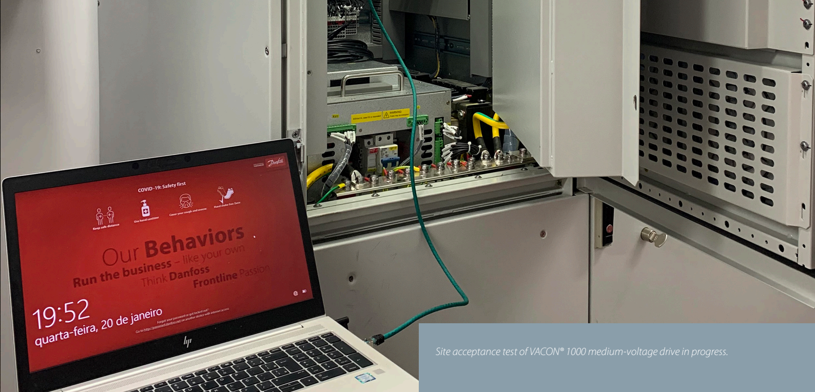
Site acceptance test of VACON® 1000 medium-voltage drive in progress.

VACON® 1000 is a general-purpose drive suitable for a wide range of medium voltage applications. It is easy to integrate into the main control systems and adapts quickly to the specific needs of each situation. This MV drive offers high environmental resistance to operate under harsh conditions, with high temperature, dust and humidity inside an electrical room.