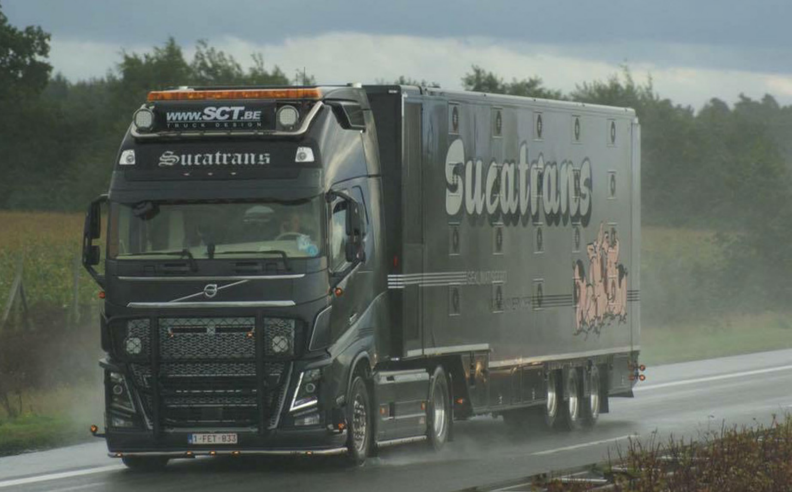
New trailer equipped with cross-ventilation from Cuppers Carrosserieën, on the road.