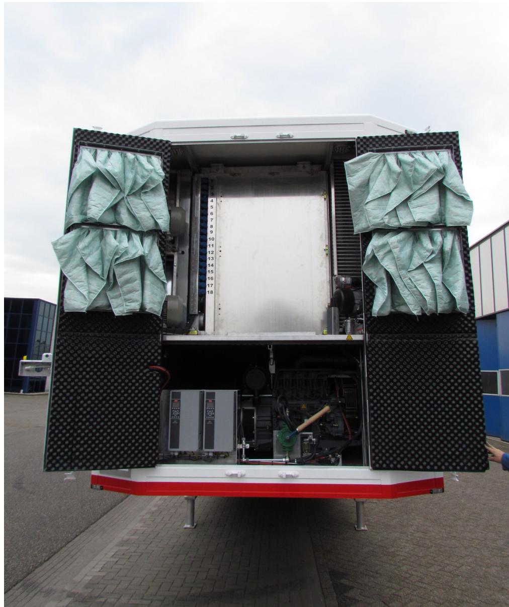
Installation front trailer

The ventilation prevents temperatures rising too high, for instance when the truck is stuck in a traffic jam in summer. In a trailer without effective ventilation the temperature would increase very quickly, something that the pigs don’t handle very well. Trucks that are used in colder climates may be equipped with a heater to pre-heat the ventilation air.