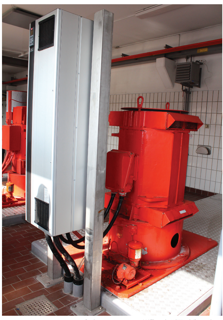
Discharge pumping station: A VLT® rated 160 kW with IP 54 enclosure controls this pump weighing 1.25 tonnes

Mads Warming Global Segment Manager Water & Wastewater mads.warming@danfoss.com Danfoss Power Electronics A/S