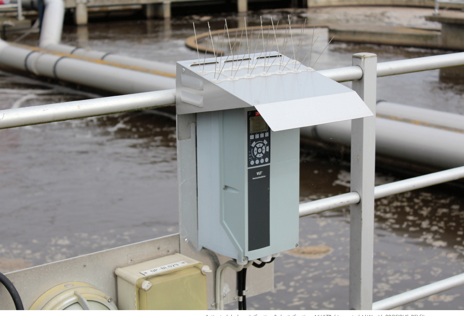
Activated sludge nitrification & denitrification: 16 VLT® drives rated 4 kW with PROFIBUS, RFI filter, IP 66 enclosure rating and climate shield control the aeration mixers.