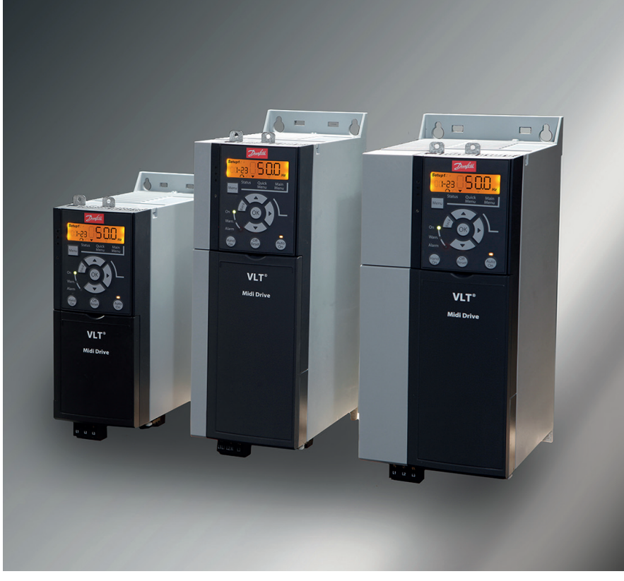
VLT® Midi Drive provides a high level of control performance, functional safety and flexible fieldbus communication, combined with design features enabling speedy installation.

ambient temperatures of 45°C at full load, and up to 55°C with derating.