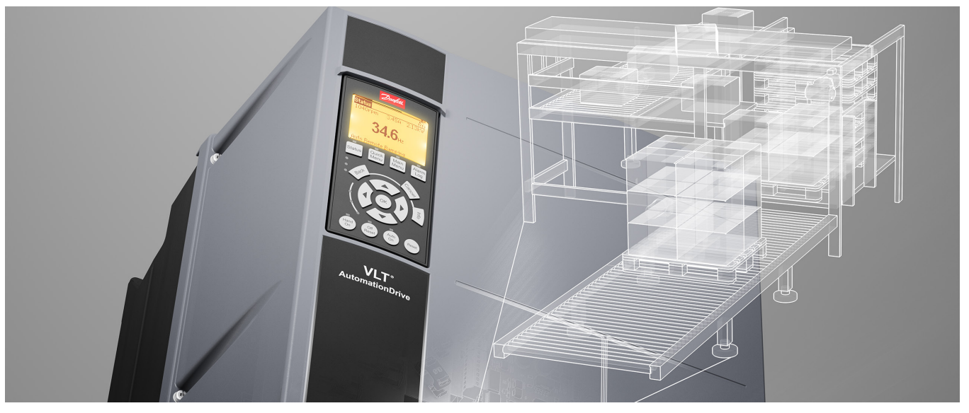
VLT® Automation Drive with Integrated Motion Controller functionality makes implementation of synchronization applications simpler and more competitive for Ariete and the biscuit factory.