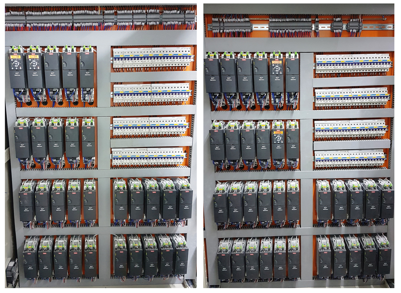
VLT® Midi Drive FC 280 and VLT® AutomationDrive FC 302 with Integrated Motion Controller installed side-by-side.