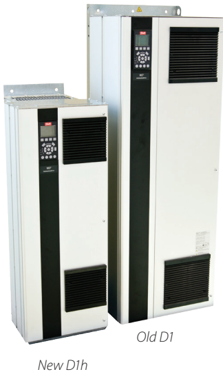
Note: The new D1h Frame VLT® drive takes up significantly less space than the older version.

The size of the new D-frame has been reduced by up to 68% to take up less space in control rooms and panels. The new IP 20 version is optimized for panel building, while providing a higher degree of safety for operators. All of the new D-frame drives will continue to use the proven back-channel cooling concept. Back-channel cooling now directs 90% (increased from 85%) of cooling air away from the drive interior and removes 90% of the heat generated by the drive.