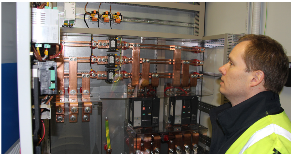
Wiring field with good access. Also the ventilation fans for the container are powered by VACON® drives.