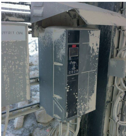
VLT® AutomationDrive operates reliably in harsh conditions.