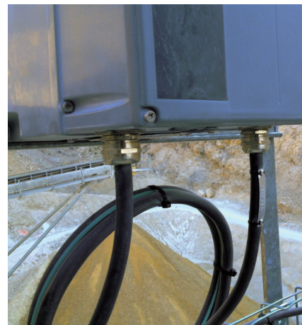
Built-in fieldbus options simplify cabling.