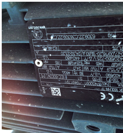
Danfoss AC drives are independent of motor technology.