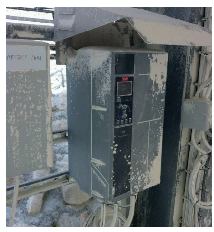
VLT® AutomationDrive operates reliably in harsh conditions.