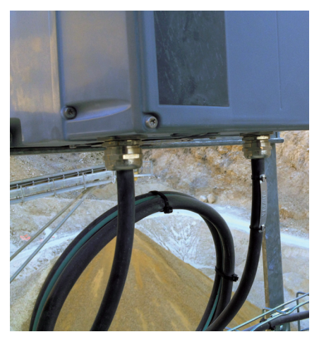
Built-in fieldbus options simplify cabling.