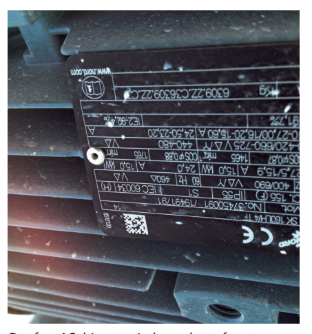
Danfoss AC drives are independent of motor technology.