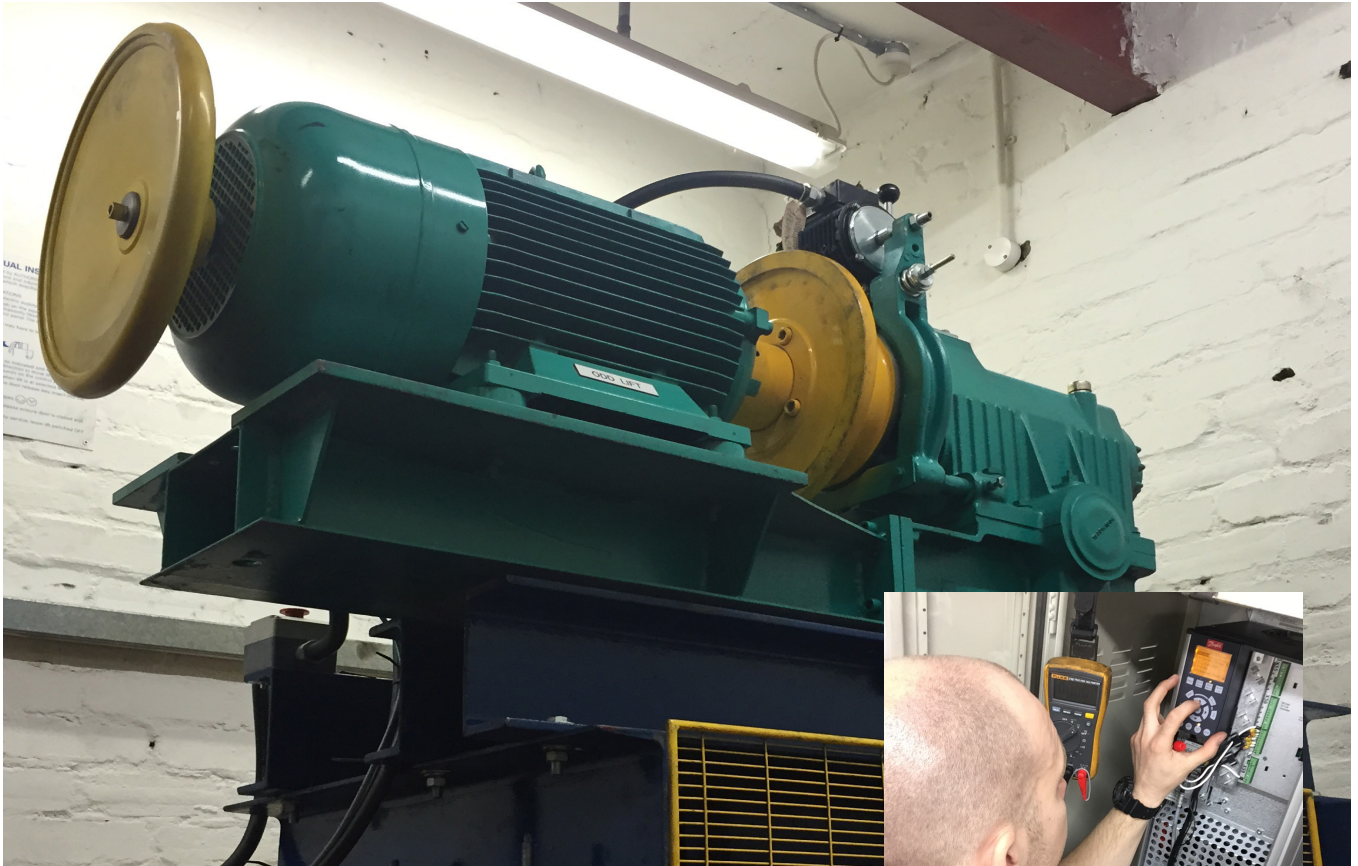
The drive for the elevator motor had failed and needed replacement.