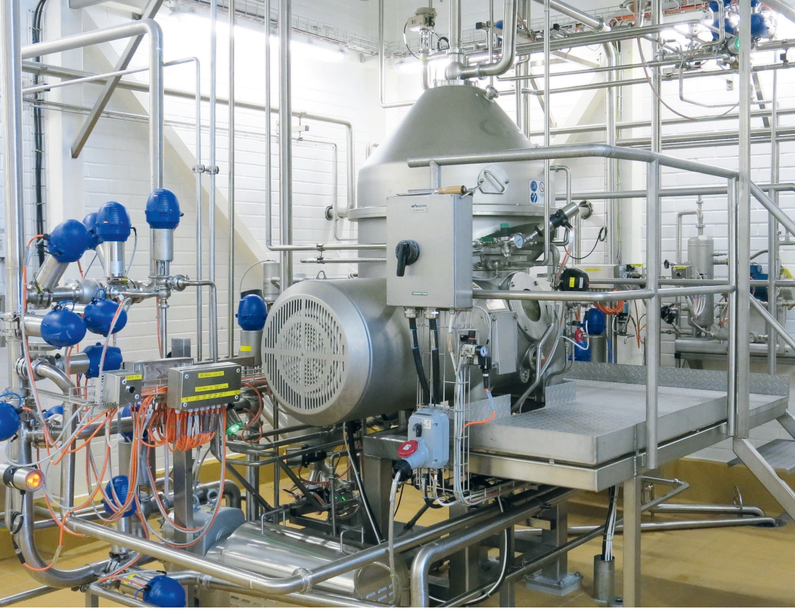
Valio's Seinäjoki plant produces all Valio quarks. A separator is used for producing quark. The pumps and mixers used by the separator are controlled by VACON® 100 AC drives. In recent years, quarks have been the quickest-growing product category in retail sales. Valio was able to quickly double its production at the Seinäjoki plant as butter production had recently moved to new premises.