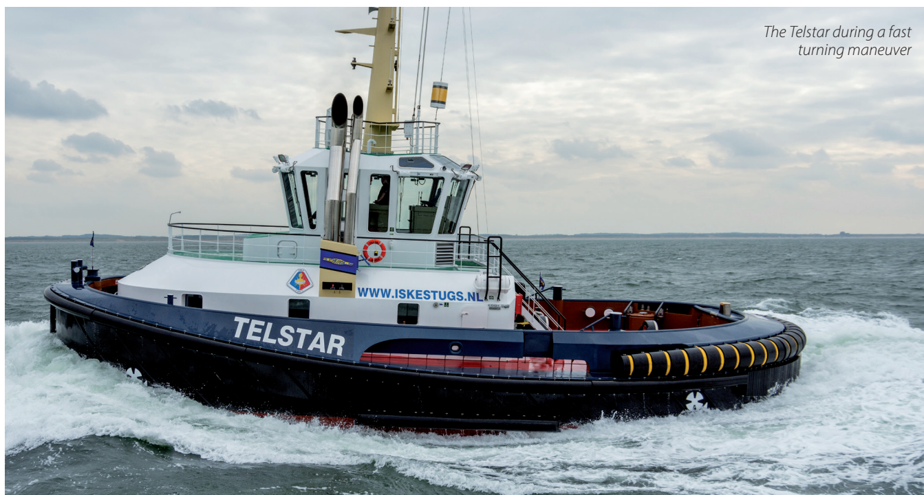
The Telstar during a fast turning maneuver