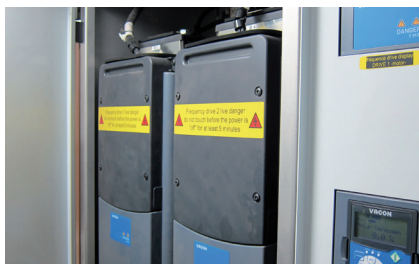
The towing winch (left) and the VACON® NXP drives for the towing winch (right)