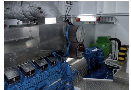
One of the Mitsubishi main engines with the Veth azimuth thruster and the permanent magnet shaft motor/generator. The main engines are used for heavy towing only.

Using only electric propulsion, the ship can travel at 10 knots (18.5 km/h), when combined with the main diesel engines the maximum speed increases to 13.5 knots (25 km/h). When running in electric mode, the vessel saves significantly on fuel costs. However, because the tug often requires peak power suddenly, the main engines are always ready on standby to supply power.