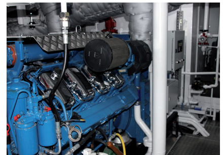
The Scania diesel generators can power the tug during transit and light towing.