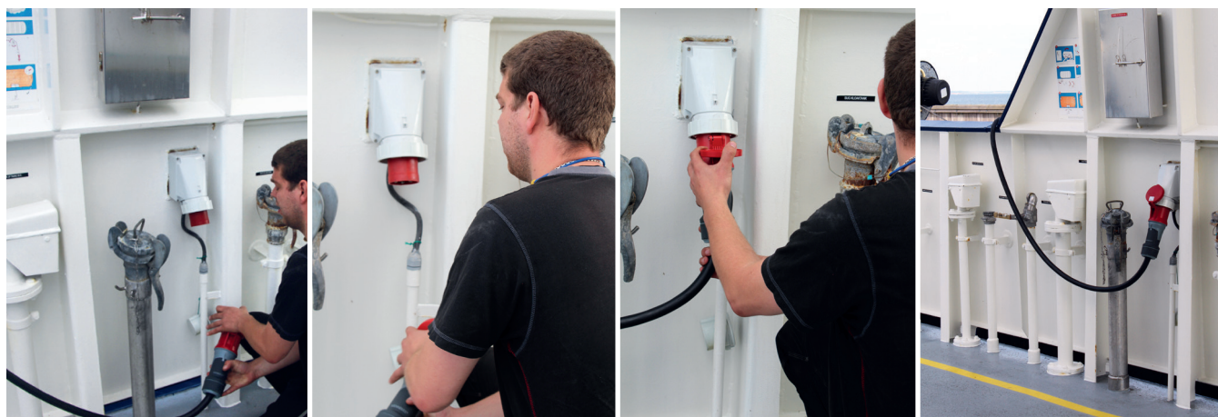
Staff connect to the shore power supply to commence charging the battery bank.

Furthermore, these batteries have a long lifetime of minimum 10 years, at a high volume of charging cycles (1 cycle = fully charged to fully discharged and back to fully charged).