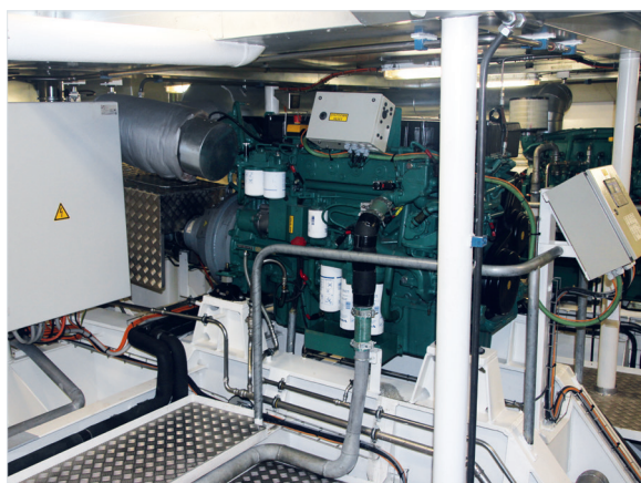
Volvo Penta marine diesel engine.

The double-ended ferry is powered by two identical Volvo Penta marine diesel engines with Schottel azimuth thrusters at each end of the vessel; each with its own engine room. There is full redundancy of the diesel propulsion.