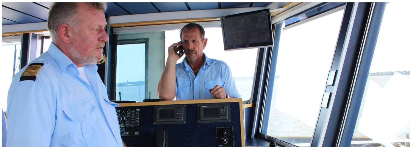
On the bridge