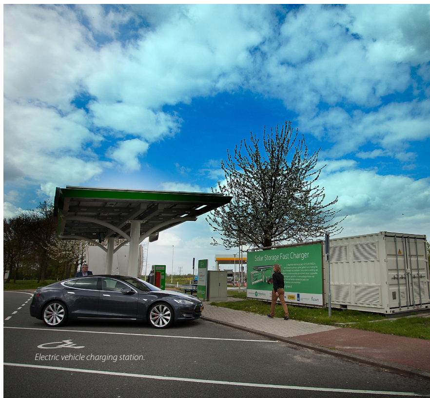
Electric vehicle charging station.

(grid operator) and MisterGreen (EV lease) have evaluated this pilot to be a success: peak loads decreased, maximum flexibility in offering variable price rates was attained, and the charging station itself became even more sustainable.