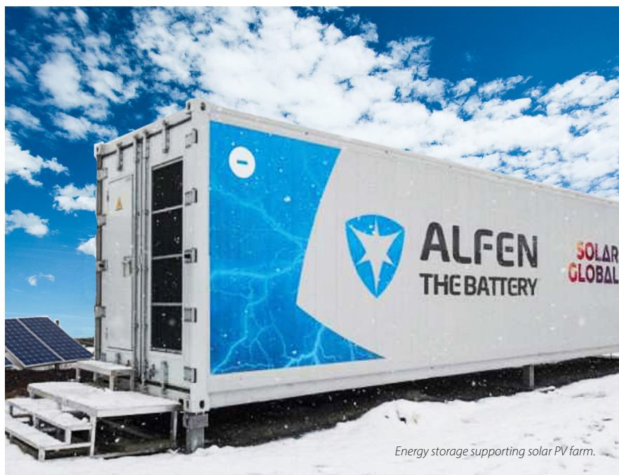
Energy storage supporting solar PV farm.

Solar Global develops and services solar photovoltaic (PV) farms and rooftop PV installations, and currently has some 100 MW capacity under service. As Solar Global wants to play an important role at the forefront of the energy transition, it is investing in an innovative energy storage solution that initially will be used for energy trading. As the local market further develops, the system is also ready for other applications, such as providing grid stability services.