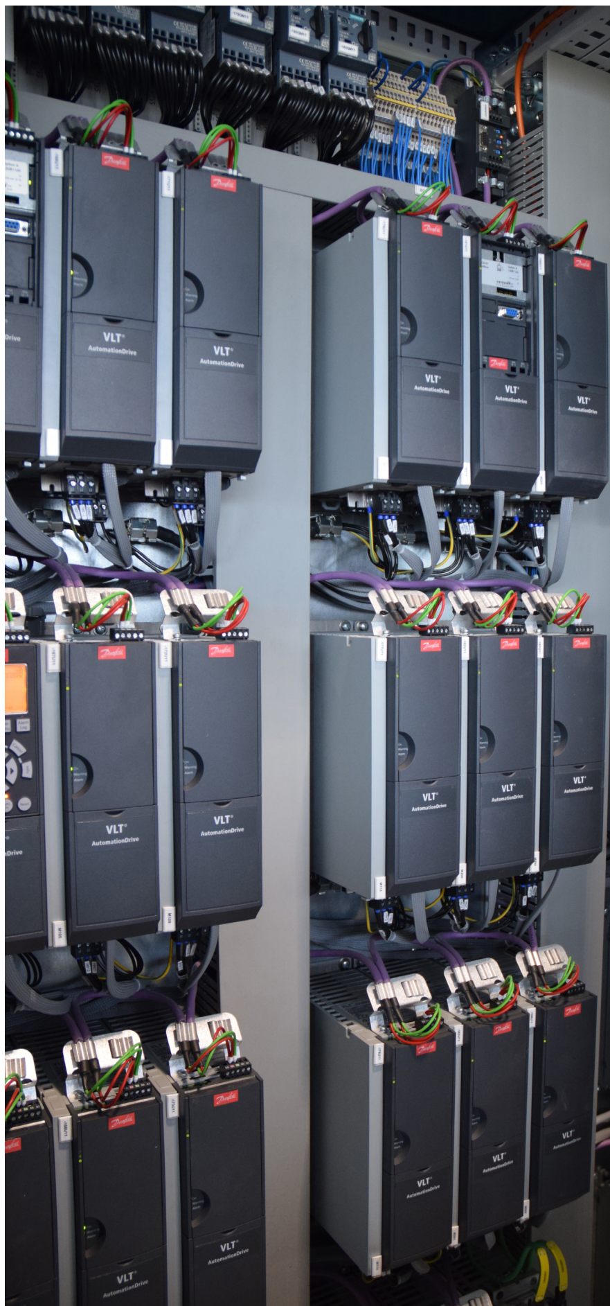
The Danfoss VLT® AutomationDrives, with suitable dimensions for the requirements of the transporter type installed on the cabinet, are designed to control the variable speed of all permanent magnet synchronous reluctance motors and made to increase flexibility and optimize the process control for any industrial machine or production line.

"The sensorless system" – observed Frosi – "guarantees services that are equivalent, if not superior, to those obtained by managing flows in a more conventional manner, using sensors and photocells. There is added value in the ability to guarantee maximum efficiency and continuity for the services provided. Indeed, you no longer need to deal with sensors and photocells that require maintenance and, if you accidentally tamper with or decalibrate them, you can significantly damage the process and create inefficiency. Especially on complex lines, for example, in the bottling industry."