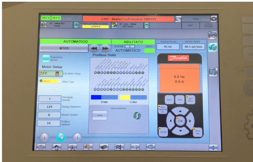
HMI for transporter automation where Sacmi replicated the LCP programming of the frequency converters to potentially modify the parameters of each device without needing to open the electrical cabinet.

The evolved automation system that Sacmi Filling was able to implement, thanks to the Danfoss VLT® FlexConcept drive system, not only avoided the direct use of sensors and related wiring, but provided even more significant added value with respect to competitiveness.