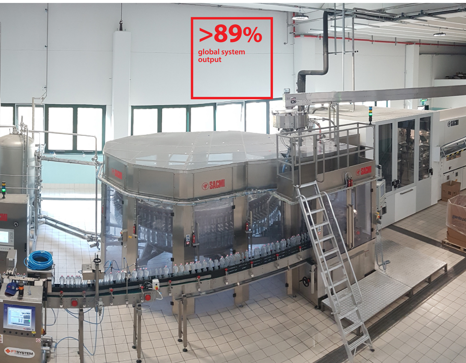
Bottling line for the production of 1.5 L bottles