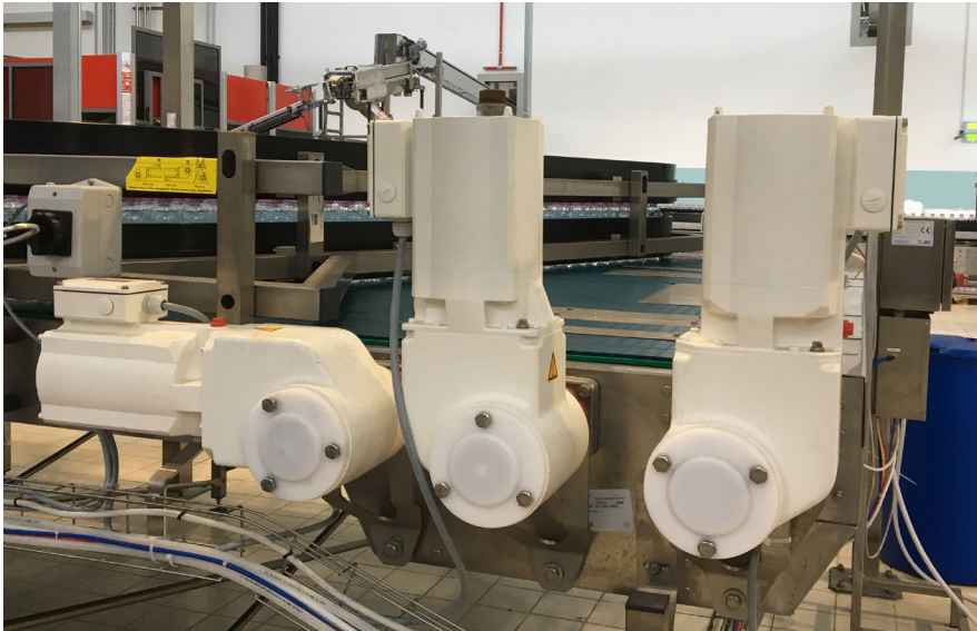
View of the Danfoss VLT® One Gear Drives, installed at the end of the line. IP 69K protection level fulfills requirements for the best hygiene and cleansing design.

"This process," concluded Forsi, "is in line with the specifics of Industry 4.0 and it can be managed and controlled via tablet and PC at all phases, for which progressive controls are planned so that any bottle that does not conform can be detected and removed without interrupting the cycle and, therefore, productivity."