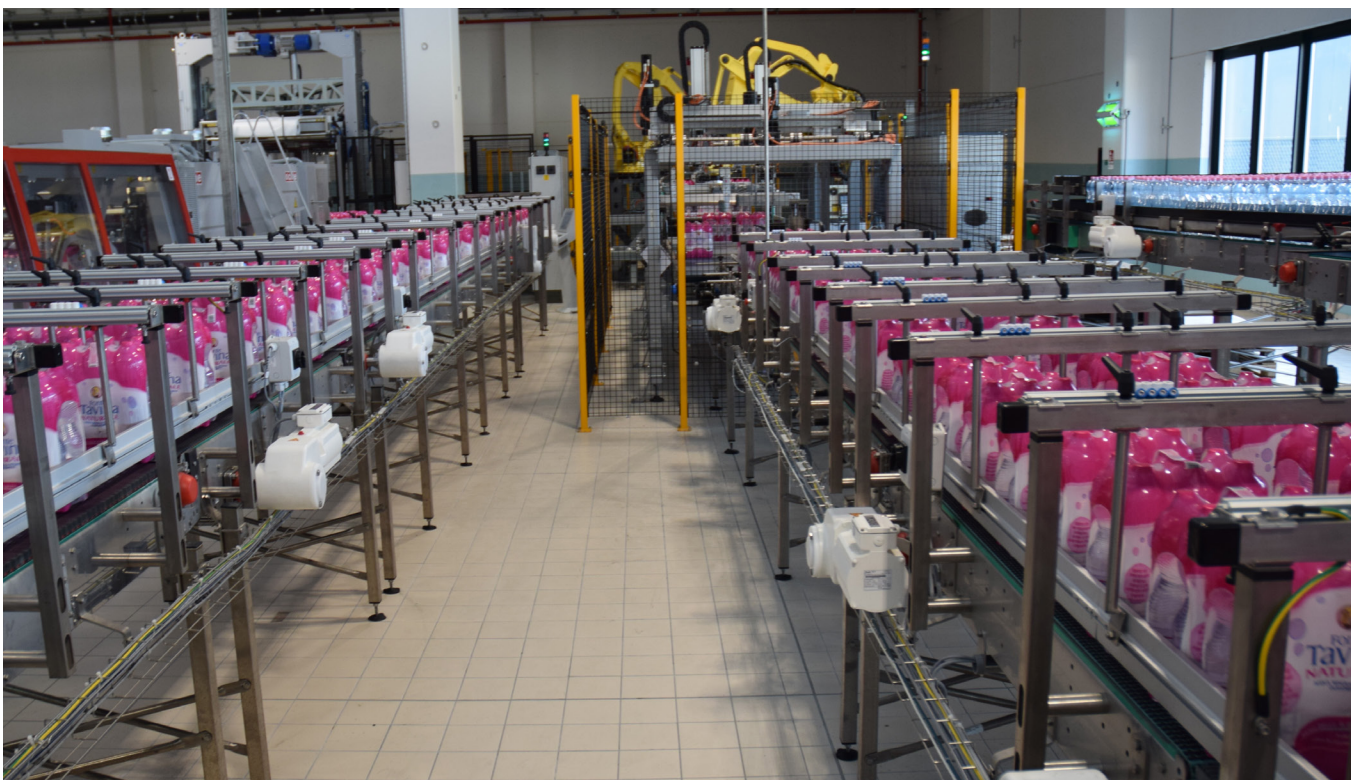
Parallel bottling lines

As previously highlighted, each line is equipped with 40 VLT® OneGearDrives positioned along the transport system. Likewise, these correspond to the Danfoss VLT® AutomationDrives, which are suitably positioned in the automation cabinet. They were designed for variable speed control of all asynchronous motors and permanent magnet motors, both with closed and open loop (the latter have been chosen and adopted by Sacmi Filling specifically for this application), and to increase the flexibility and