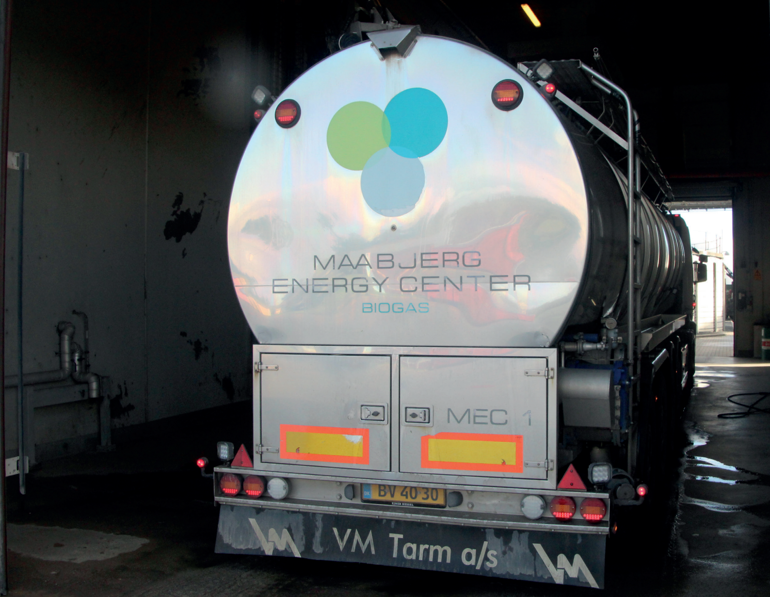
VLT® AutomationDrive FC 302 controls critical applications, such as pumps, blowers, decaners and screw conveyors, and ensures reliable operations at MEC – BioGas.