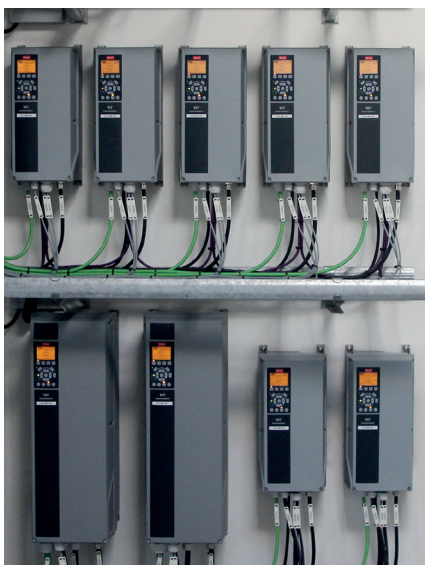
MEC – BioGas has used enclosure rating class IP55 for a number of their VLT® AutomationDrive FC 302 drives, because this type is especially suitable for installation in demanding environments.