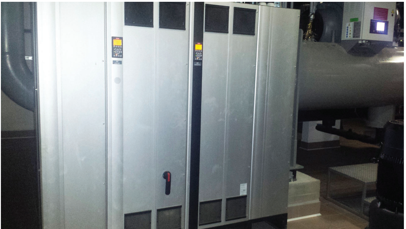
These VLT® Low Harmonic Drives control the new compressors in the technical room.

In agreement with the designer and the hospital, Danfoss suggested the active solution VLT® Low Harmonic Drive (LHD), where the AC drive and active filter are combined in one unit. The active filter is assembled parallel to the AC drive input; therefore, the AC drive operates normally in the event of filter malfunction and provides operation of the cooling system. Important factors taken into account by the hospital when adopting the decision were the list of spare parts, 24/7 service support, and smooth commissioning.