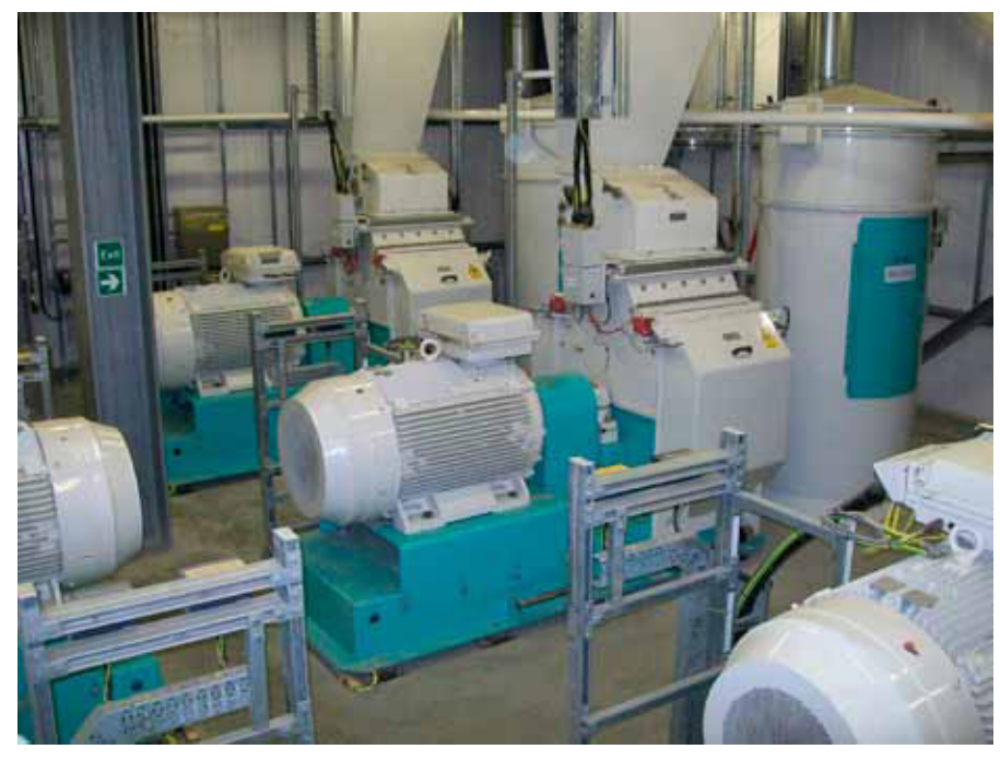
Hammer Mills powered by VLT ® High Power Drives.

Danfoss VLT® AutomationDrives for this project include integrated Profibus DPV1 for communication with the Emerson DCS control system, SIL2 Safe Stop technology avoiding the need for costly & bulky contactors; and ATEX approved thermistor supervision simplifying the protection of Ex rated motors in hazardous areas.