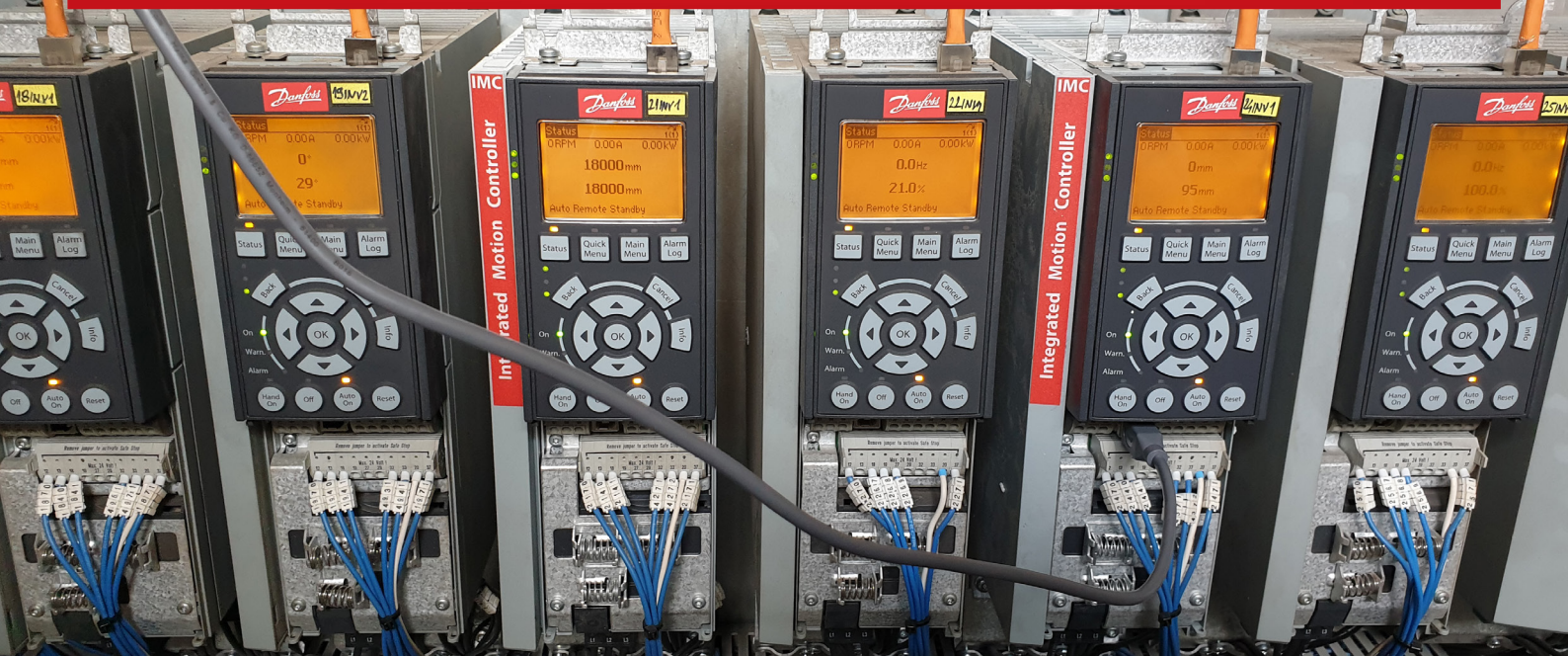
Blue cables show comms from encoder - yellow cables are for Modbus TCP comms