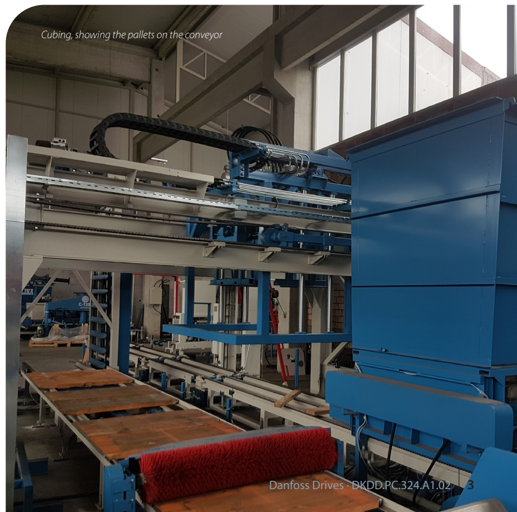
Cubing, showing the pallets on the conveyor

Two drives are at work. One drive uses IMC in rotation of rows to stagger the packing of a stack. The other drive positions the stacked concrete blocks on the pallet. The distance from the conveyor to the pallet is different, depending on the stack dimensions.