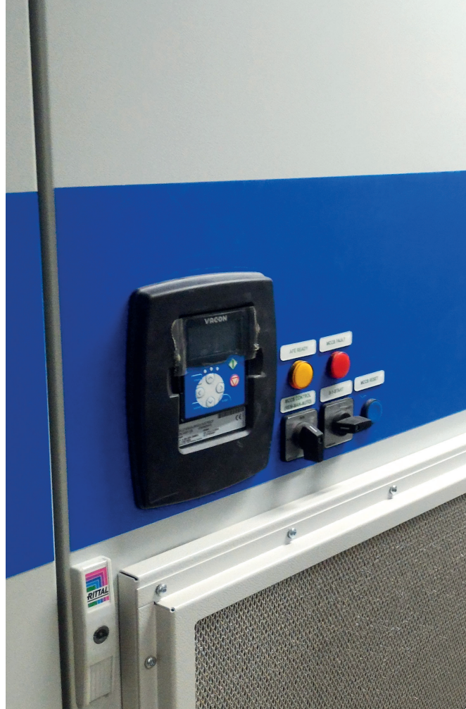
The VACON® NXC series low harmonic drive delivers a total power of 2 MW.