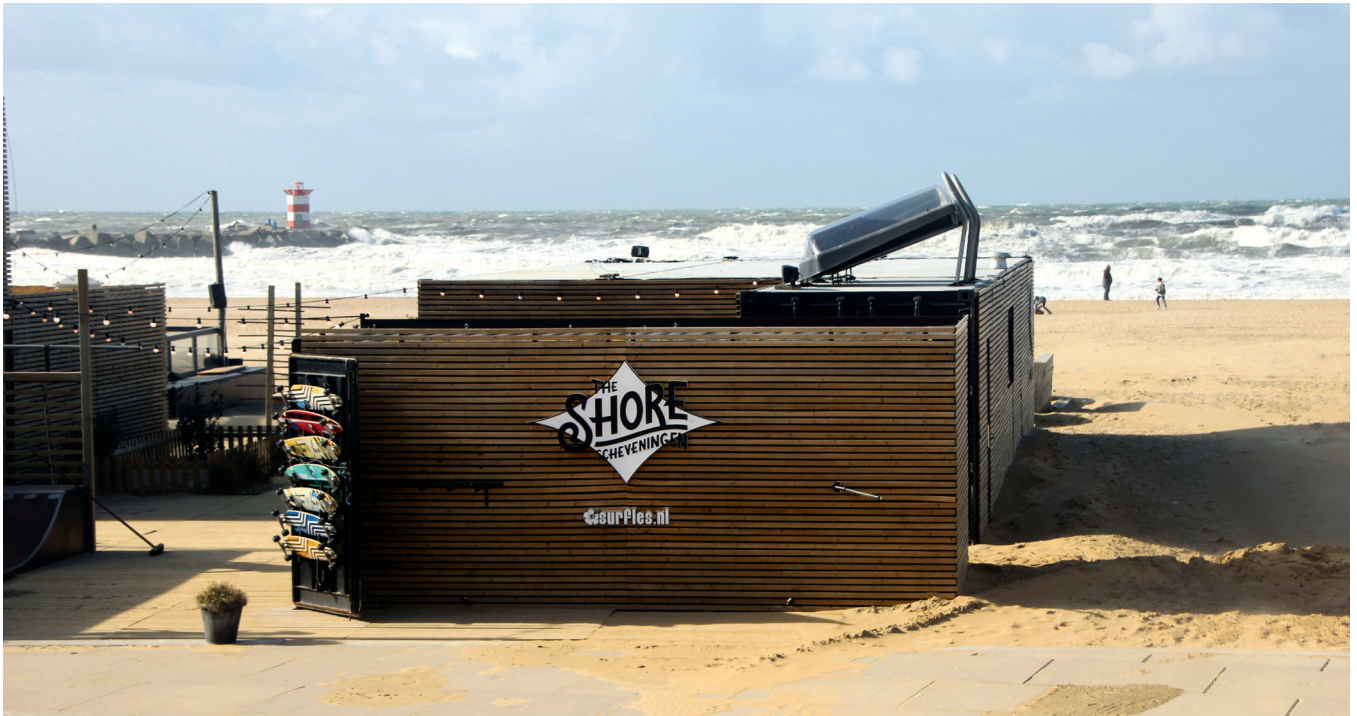
Scheveningen is the Dutch Surfer's Paradise where the citizens and visitors enjoy the clean air and the waves.