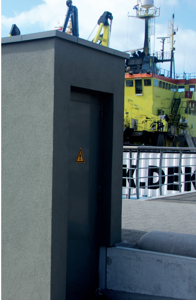
The shore power supply system is located underground. Here only the entrance is visible.