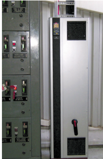
VLT® FC 302 in operation

Once again Danfoss provided a fast and secure return on investment, in this case by means of the electrical energy savings, thus contributing to the environment and making a significant improvement in Bimbo's carbon footprint..