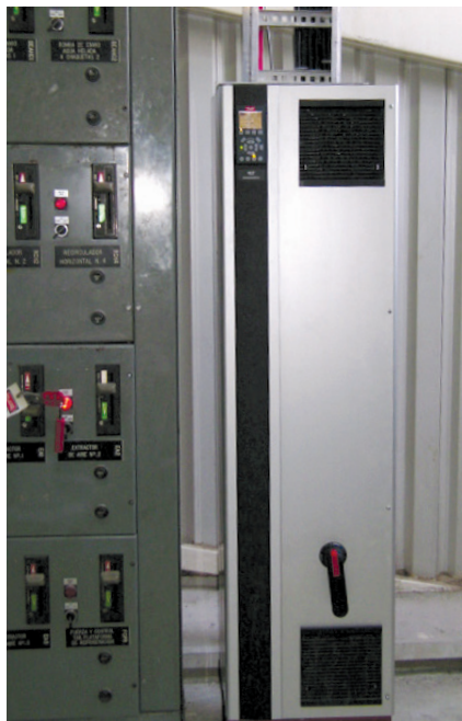
VLT® FC 302 in operation

Once again Danfoss provided a fast and secure return on investment, in this case by means of the electrical energy savings, thus contributing to the environment and making a significant improvement in Bimbo's carbon footprint..