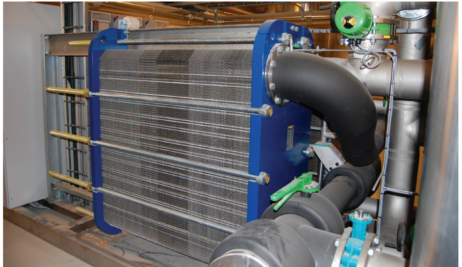
The cooled water from the heat exchanger is circulated in the building to cool rooms to the desired temperature. No active refrigeration is required.

In winter, water from the reservoir, which has accumulated heat during the summer period, is pumped through the heat exchanger and back down to the wells. Heat from the heat