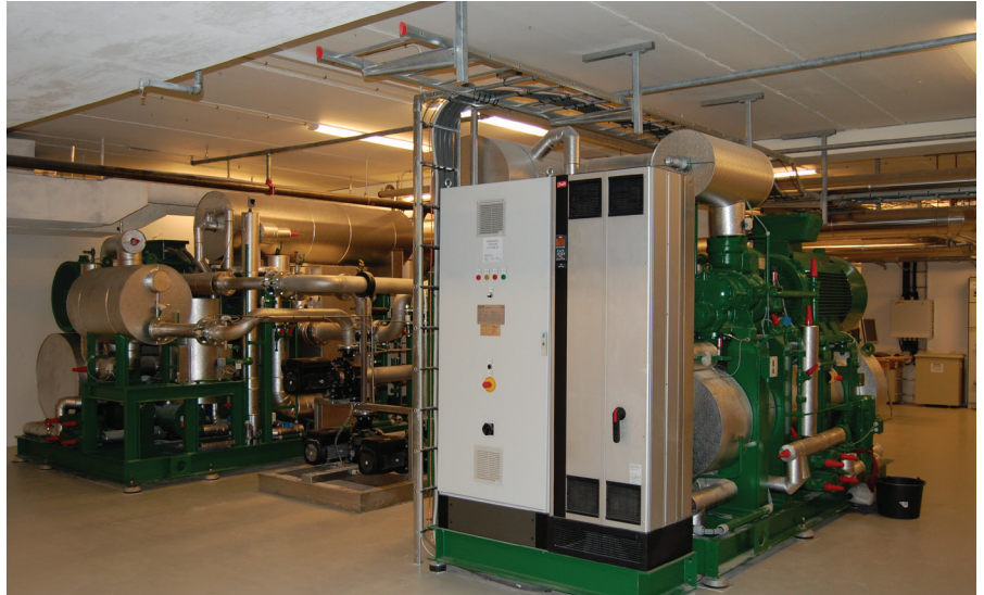
Two AC drives in the form of 355 kW VLT® HVAC Drive FC 102 IP54 control the screw compressors which enable the two GEA Greenco heat pumps with a combined performance of 2,400 kW to adjust the heat capacity continuously from low to full performance, with the same efficiency.

The hotel has been built to the Danish building regulations' Low Energy Standard, Class 2, which stipulate consumption of no more than 42.6 kWh of energy per square metre annually.