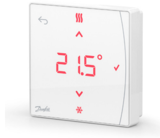
Danfoss Icon2™ RT 088U2121