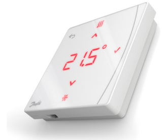
Danfoss Icon2™ Featured RT (IR sensor) 088U2122

Danfoss Icon2™ RT is a series of wireless thermostats that offers the freedom to place your thermostat without the constraints of wires in the wall. The fade away feature, together with the minimalistic design, only 16 mm deep, gives it elegance and makes it blend in with the surroundings.