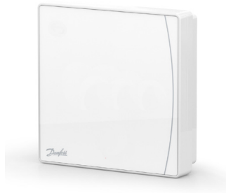
Danfoss Icon2™ Sensor 088U2120