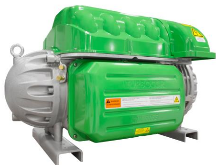
Figure 1: Turbocor compressor TGS490

Danfoss Turbocor® model TGS490 oil-free compressor has a capacity range of 85 tons / 300 kW to 140 tons / 490 kW and can be used in air or water-cooled chiller applications. The TGS490 compressor offers industry-leading efficiency with integrated part load values (IPLV) up to 50% better than a comparably sized screw chiller. The new TGS490 is the world's first oil-free, magnetic bearing centrifugal compressor that offers the flexibility to be used with either ultra-low GWP HFO-1234ze or R-515B. See more information on Turbocor.Danfoss.com