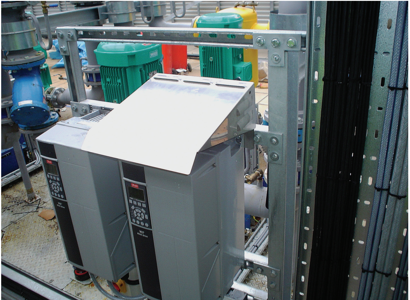
Danfoss FC series can withstand even the harshest pressure washing environments. A NEMA/UL Type 4X rated enclosure provides maximum mounting flexibility