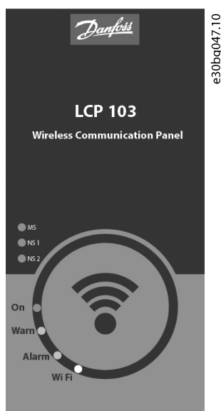
Illustration 1.1 VLT® Wireless Communication Panel LCP 103