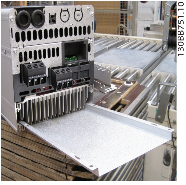
2. Slide in the backplate.