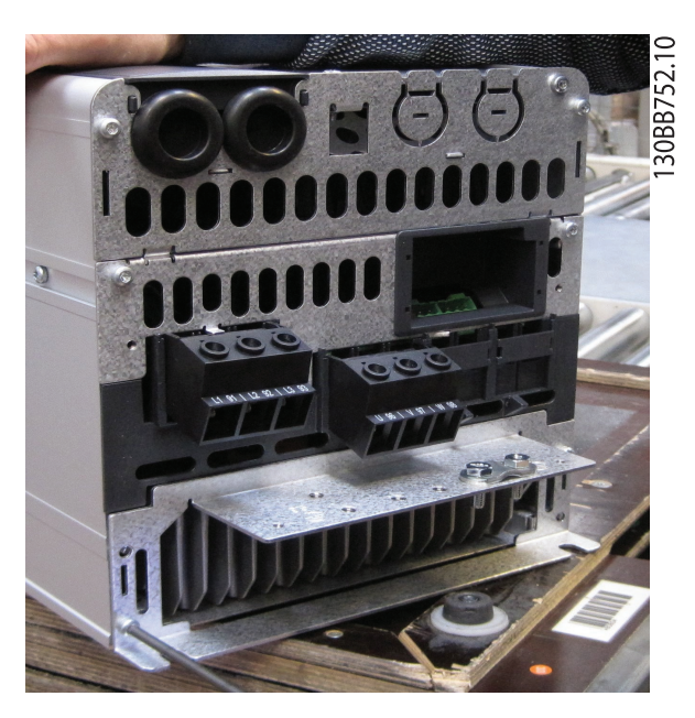
3. Mount the bottom plate again with the four screws and with a torque of 2,5 Nm.