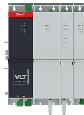
VLT® Multiaxis Servo Drive MSD 510