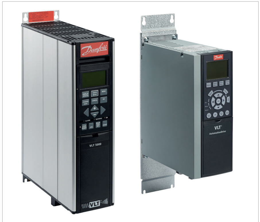
Adaptor plate, FC302 and a MCA114 PROFIBUS converter can easily replace a VLT5000

Owners can therefore exchange old drives with new drives in existing systems with ease. This is an advantage when a high degree of flexibility in upgrade strategies is required.