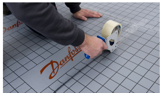
Fig. 6: Joints without any overlap should be taped up. When using liquid screed tape overlapping joints.