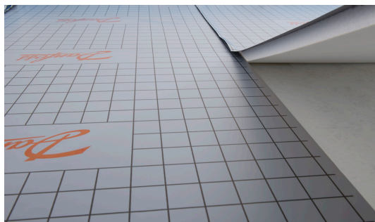
Fig. 3: Observe the overlap throughout installation.