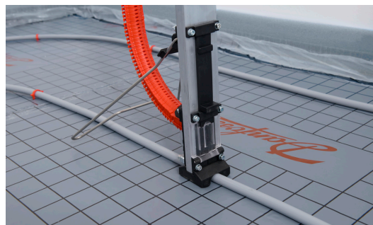
Fig. 8: Position tacker vertically over the required spot and fasten pipe by pushing down the tacker handle.