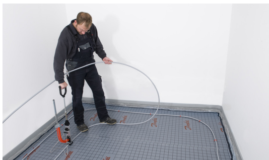
Fig. 7: Tack down Danfoss composite pipe with two BasicClip clips per metre.