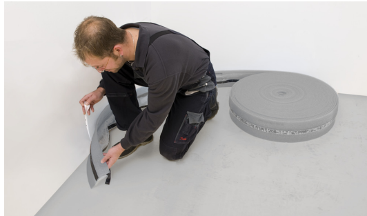
Fig. 1: Attach the perimeter insulation with tape on wall. 1