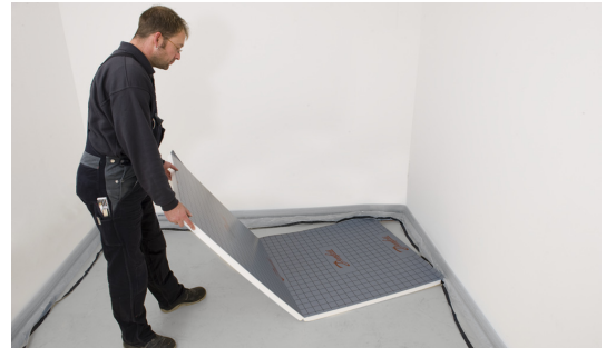
Fig. 2: Begin laying insulation panels with the overlay flap upright against the wall.