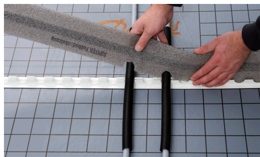
Fig. 10: Install expansion joint profile e.g. for door thresholds, as shown, using the Basic movement gap strip.

1 If additional insulation is 5 cm thick or more, attach the perimeter insulation on the additional insulation.