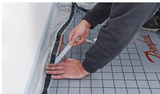
Fig. 5: Attach perimeter insulation, tension free, by using the self adhesive strips.