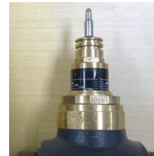
2 nd Gen