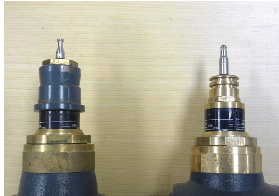
1 st Gen