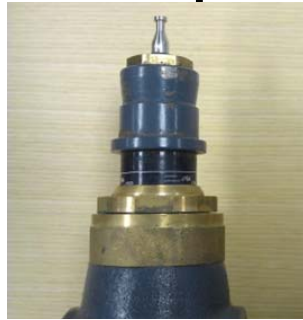
1 st Gen