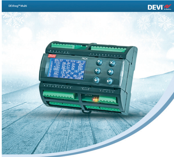
Installation and User Guide