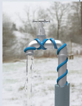
Frost protection of pipes