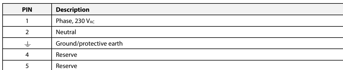
Table 3 Pin configuration of heater (pin configuration does not matter)