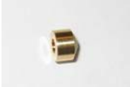
Fig. 1: Spindle extender for FHV-R valves

This spindle extension can correct an error in the closing measurement on some installed FHV-R valves. The error may be experienced with valves produced until March 2004. The customers will experience the error as a difficulty with adjusting their heating (the valve closes at too high a temperature).