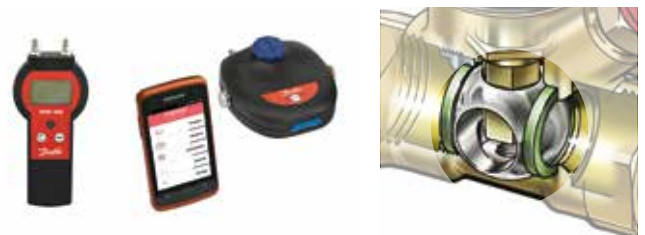
LENO™ MSV-B valve with internal thread

When the LENO™ MSV-B is locked, the valve becomes a ball valve. This feature has several advantages: The valve has zero leakage, opening and closing the valve is much easier because it takes only a quarter turn and closing the valve will not influence the setting in any way because the setting mechanism and the shut-off mechanism are completely separate. The position of the LENO™ (open or closed) is clearly shown by a red indicator.