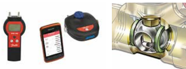
LENO™ MSV-B valve with internal thread

When the LENO™ MSV-B is locked, the valve becomes a ball valve. This feature has several advantages: The valve has zero leakage, opening and closing the valve is much easier because it takes only a quarter turn and closing the valve will not influence the setting in any way because the setting mechanism and the shut-off mechanism are completely separate. The position of the LENO™ (open or closed) is clearly shown by a red indicator.