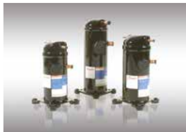
Performer® Scroll Compressor