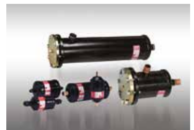
Eliminator® Filter driers