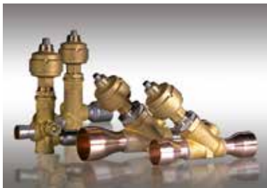
Electronically controlled expansion valve