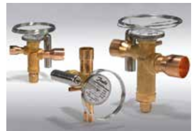
Thermostatic expansion valve