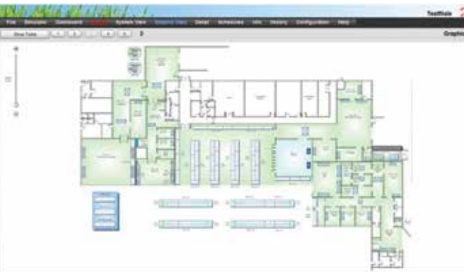
Custom graphics, available in local screen and Web browser

Whilst utilizing web browsers and web technology is nothing new in the controls world, the System Manager attempts to actually take advantage of this technology and present system information in a meaningful and rich way. Unlike many of the products in the market today, the System Manager does not simply show a range of data tables in mash of browser screens, rather, it presents a fluid blend of dashboard, automatically generated system graphics and asset detail screens. Whether its a history log, current status or setpoint changes, all actions are easily achieved in one flowing web experience.