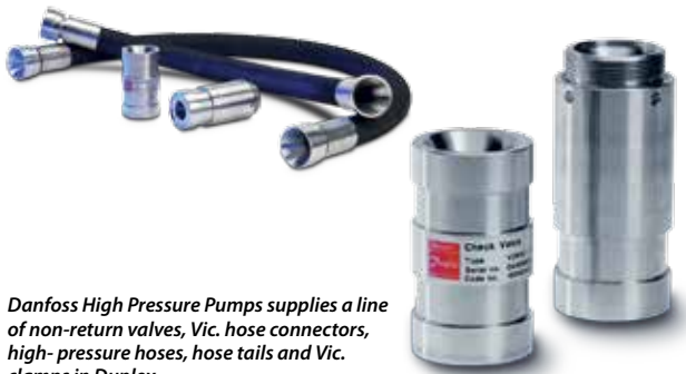
Danfoss High Pressure Pumps supplies a line of non-return valves, Vic. hose connectors, high-pressure hoses, hose tails and Vic. clamps in Duplex.

Capacity: Wide flow range that fits to our pump range.