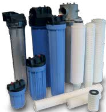
A wide range of filter housings and cartridges for pre-filtration is available.

It is recommended to use filters from the Danfoss filter product range.