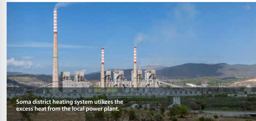
Soma district heating system utilizes the excess heat from the local power plant.