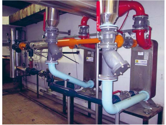
Heating station "SKPC Mejdán" after reconstruction