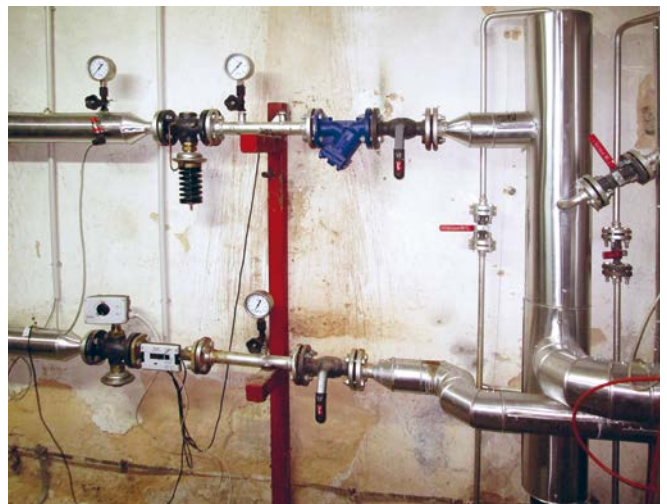
Heating station "BKC" after reconstruction