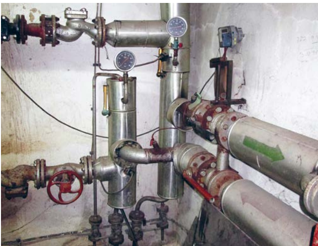
Heating station "BKC" before reconstruction