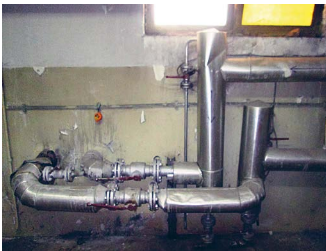
Heating station “Cipelići” before reconstruction