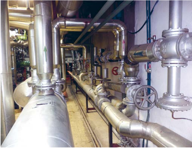
Heating station "SKPC Mejdán" before reconstruction