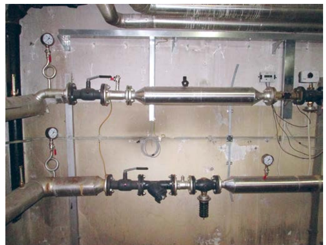
Heating station “Cipelići” after reconstruction