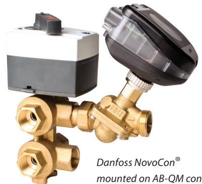
Danfoss NovoCon® mounted on AB-QM controls both room temperature and the actuator mounted on the heating/cooling change-over valve.

The indoor climate presented a challenge for the BMS designers. Because the building was completely rebuilt during the revitalization, the new tenants would at first have office space available without any separation walls. The offices would be individually designed later, using flexible partition walls. With no knowledge of the later use of the spaces, the BMS system had to be planned and installed with the greatest flexibility. "So, we had to do our planning with the idea in mind that every imaginable scenario could be implemented later," Andreas explains.