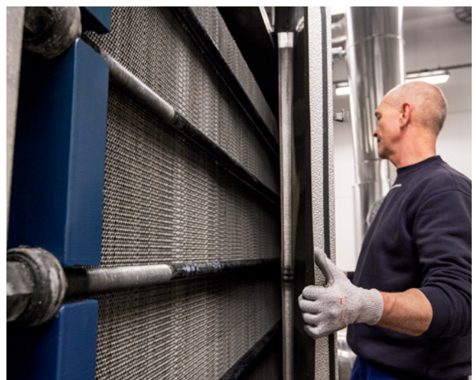
Replacing the old heat exchangers' plates with new ones at AffaldVarme Aarhus