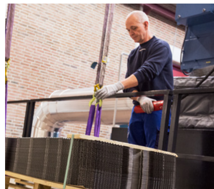
Replacing the old heat exchangers' plates with new ones at AffaldVarme Aarhus