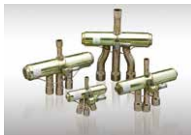
4-way reversing valve