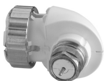
Angle adapter 013G1350