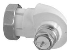
Angle adapter 013G1360