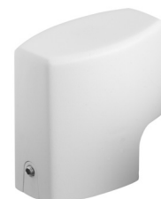
Compact adapter 013G5190