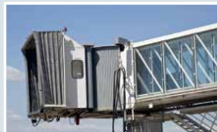
Special air conditioning application (boarding bridges...)