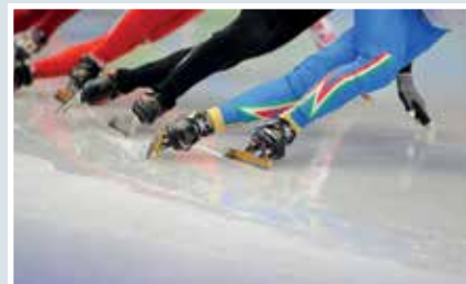
Chiller with brine application (process, ice rink...)