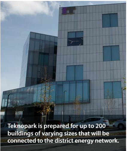
Teknopark is prepared for up to 200 buildings of varying sizes that will be connected to the district energy network.