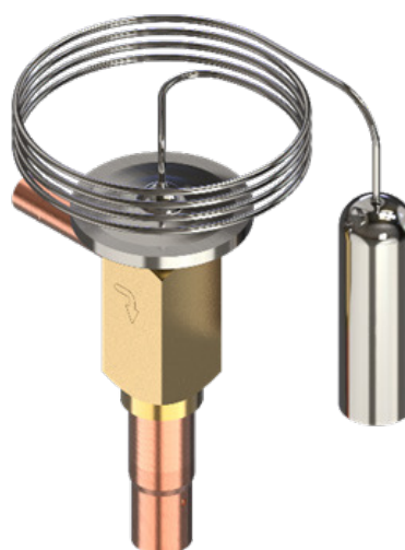
New stainless steel capillary tube and bulb

Adapting to market demands and customer requirements, Danfoss will change the material of the capillary tube and bulb of TD1/TDE1 thermostatic expansion valves from copper to stainless steel. Bulb clip/strap accessory will be changed to the dedicated bulb strap designed for the cylindrical stainless-steel bulb.