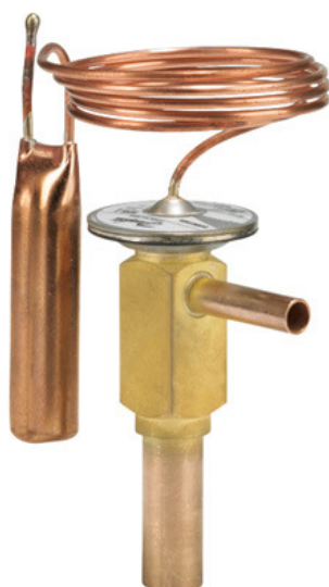
Old copper capillary tube and bulb