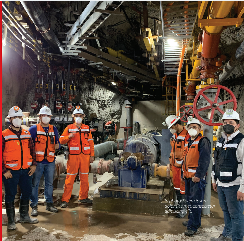
In photo: Lorem ipsum dolor sit amet, consectetur adipiscing elit.

Installing an effective water pumping system became a multi-phase project. Firstly, the diagnosis was made following on-site visits, then evaluation and selection of solutions commenced. Finally, the solution was installed and commissioned. In each of the phases, Danfoss worked together with the solution integrator and business partner Autronic. Their combined talents formed a multidisciplinary technical and commercial team, which initiated a process of constant communication with users to analyze the various phases of the implementation of the solution.