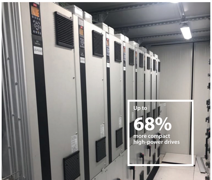
The extremely powerful and compact VLT® AQUA Drive in enclosure size D regulates flow rate, and is a fundamental component in minimizing energy consumption.

simplified internal design, they can therefore be installed even when space is limited and, just as importantly, they require very little periodic maintenance. iSave devices, which recover the hydraulic energy of the reverse osmosis process discharge flow, drastically reducing energy consumption, are also extremely compact and can be integrated with Danfoss high-pressure pumps".