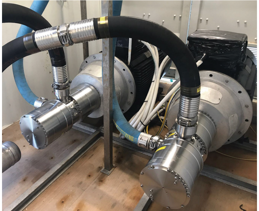
Mr Tota explains: "The volumetric technology of Danfoss high-pressure pumps enables us to create systems that are not only energy-efficient but also extremely compact."

In a reverse osmosis desalination plant, the most energy-intensive process is in the first osmosis stage, where the osmotic pressure due to the salinity of the water is overcome by high pressure circulation. Danfoss innovative high-pressure axial piston pumps, combined with Danfoss iSave isobaric energy recovery devices, proved to be ideal for