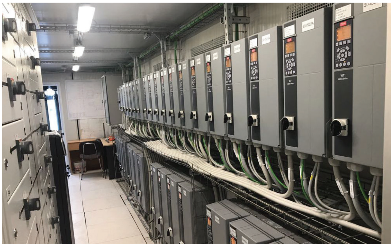
Acciona has optimized the overall efficiency of the plant and the space occupied inside the containers, thanks to the unique compactness of VLT(R) AQUA Drive.

Thanks to its extensive experience in the field of reverse osmosis desalination, gained in construction of plants of all sizes all over the world, Acciona offered an innovative solution to Sarlux, comprising a six-year full-line supply contract for an ultrapure water supply service. The tariff is economically competitive with the alternative water supply.